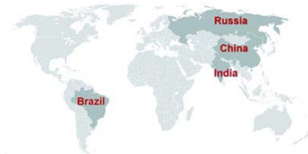
Figure 1. The BRIC Nations of Brazil, Russian Federation, India, and China are Recognized as the Next Leading Forces in the Global Economy.

UNICEF (n.d.) provides statistics on all of the BRIC nations as noted in Table 2 for years 2004 and 2005. Three of the BRIC nations—Brazil, China, and the Russian Federation—are represented in statistical gathering of World Education Indicators (WEI or WEI Programme), as indicated for years up to 2003. The WEI Programme includes 16 other countries, as well, for what the sponsoring organizations call coverage of “over 70% of the world’s population” [41].